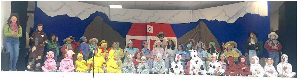
Carson Valley Arts Council is proud to support and fund arts in our local schools. Dozens of students at Gardnerville Elementary Schools worked with Missoula Children's Theatre to perform "Beauty Lou And The Country Beast" in March.