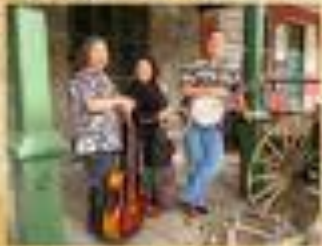
FRONT PORCH BAND - 11:30

10:30 CHILDREN'S & PET PARADE • OLD TIME CHILDREN'S GAMES ALL DAY!