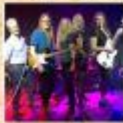
MOXY RUCKUS - 11:15