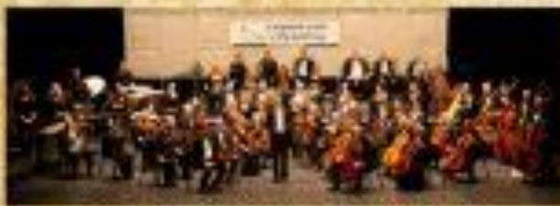
CARSON CITY SYMPHONY - 3-4:45

CHICKEN DINNERS AVAILABLE FOR PURCHASE FROM THE GENOA FIRE DEPARTMENT STARTING AT 11 AM