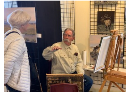
Local artist exhibits returned to the Carson Valley Arts Council Copeland Gallery